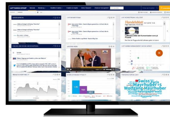
Customer example: Portal (Lufthansa)