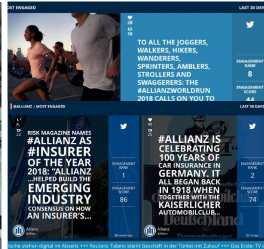
Customer examples: Videowall (Lufthansa) and Newsscreen (Allianz)