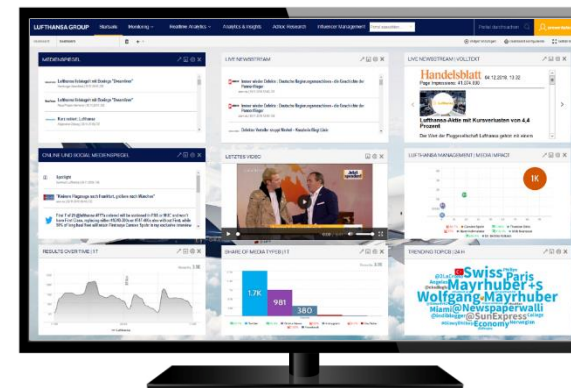
Customer example: Portal (Lufthansa)